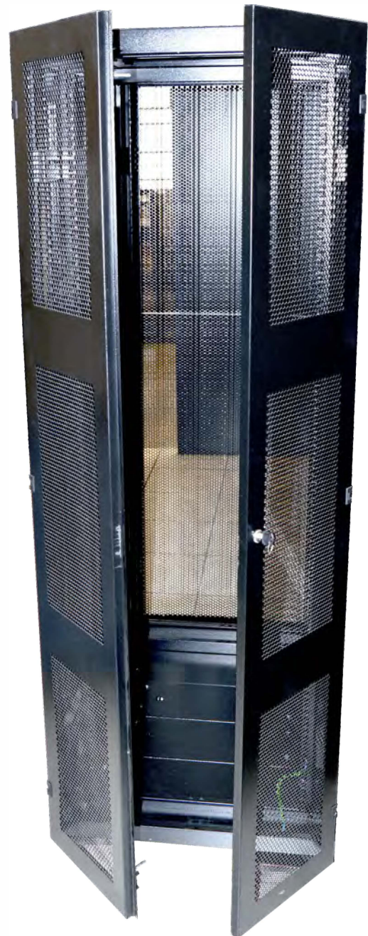
Saloon type rear doors