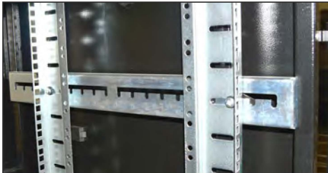
Quick Adjust System