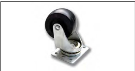
Roll into position Castors (option)