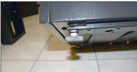
H/D Load bearing levelling feet